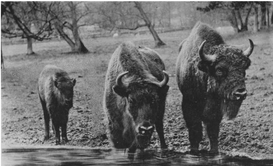
Fot 2. European bison in Boitzenburg

In 1932, BOTHO-ERNST was born as the first European bison whose parents were both born in Boitzenburg, and three years later he founded the third generation.