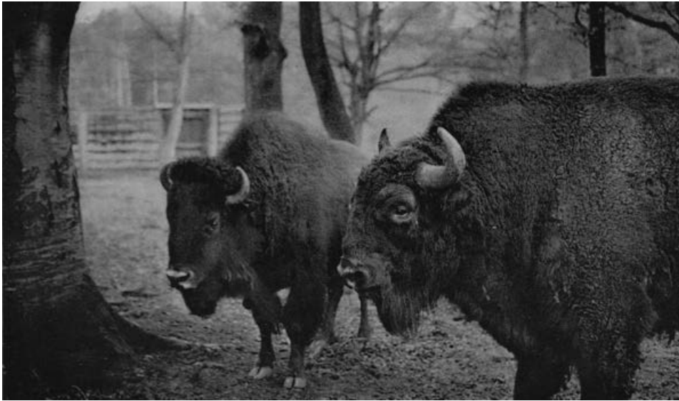
Fot 5. European and American bison in Springe (year 1941)