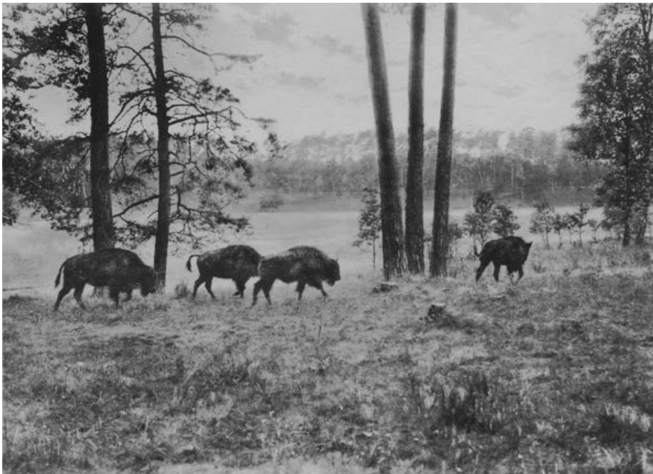
Fot 6. Wisents in Schorfheide