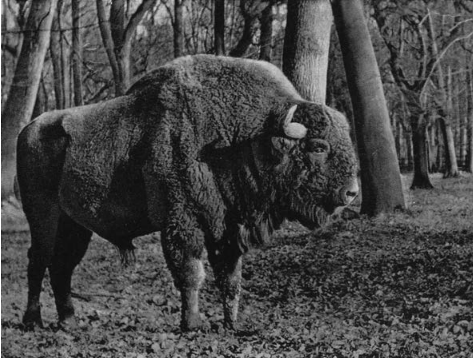
Fot 7. M 558 BENNO (Springe)

1940. Some other animals were transferred to the Darß Forest on the Baltic Sea and the former imperial hunting ground in the Schorfheide, where E. bison breeding was practiced until the collapse in 1945 (Fig. 7). Some more animals from Springe were moved to the “Wildgehege Neandertal” and into the long forgotten enclosures in the East Prussian “Elchwald” and in Wilhelmsthal near Eisenach (Fig. 8).