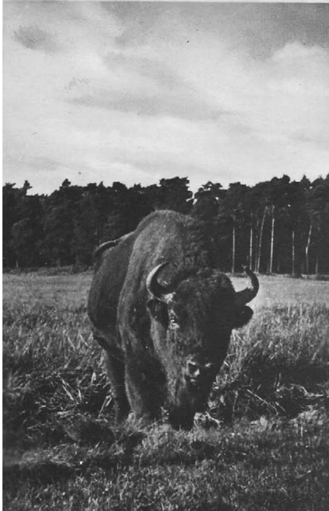
Fot 4. M 249 SPROSS in Darß

A bull from Springe and two cows from Hellabrunn later founded breeding group in Hardehausen in 1958. All three animals can already be traced back to the Boitzenburg line in the "grandparents generation". Only in Springe and Hardehausen, more than 500 European bison have been born since the beginning of the breeding program, of which the predominant part descends of Boitzenburg ancestors.