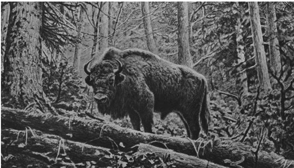
Fot 1. Bison bonasus caucasicus wild

Into this primeval forest region of eastern Poland, back then part of the Tsar empire, the last Lowland bison had retreated after centuries of destruction of their habitat and hunting all over Europe. Apart from Białowieża, there was left only a small population of the mountain variety of this species, which had been discovered a short time before, in the Caucasus (Fig. 1).